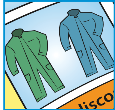
Set of three items