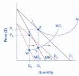
(b) Loss induces exit, shift to zero profit

NB for a level 3 response there must be at least one valid diagram. The diagram can show either a fall in AR/MR or a rise in costs, or both. The diagram also earns credit as a static diagram, but explanation of changes is still required.