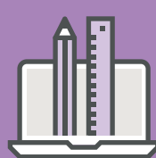
DELIVERY GUIDES (TEACHERS)