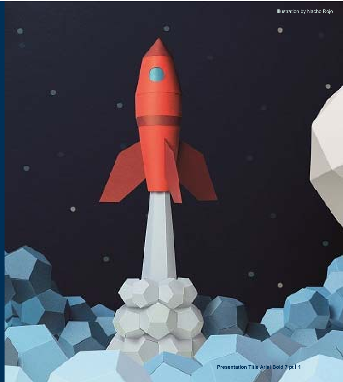
Illustration by Nacho Rojo