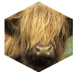
Hair and Beauty