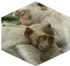
Health and Social Care