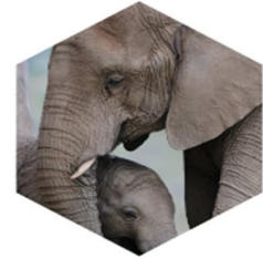
Caring for Children