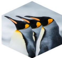
Hospitality and Tourism