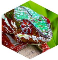
Art and Design