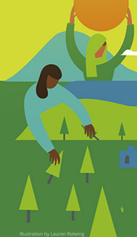
Illustration by Lauren Rolwing