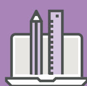
DELIVERY GUIDES (TEACHERS)