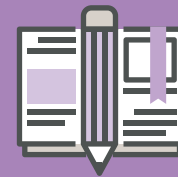
STUDY SKILLS GUIDE SHEETS

To find out more visit qualifications.pearson.com/lcci