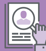
SAMPLE ASSESSMENT MATERIALS