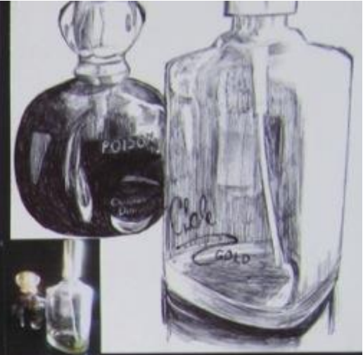
Pen I used a black ballpoint pen to draw this piece because I liked the texture of ballpoint pens, especially with the rough and harsh lines. I was able to display lines more prominently since the picture had somewhat contrasting lighting.