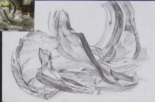
Pencil I chose to draw this piece with a pencil because I thought that I would be able to draw more details and emphasize the reflections of light through the glass by being able to change the darkness of the lines.