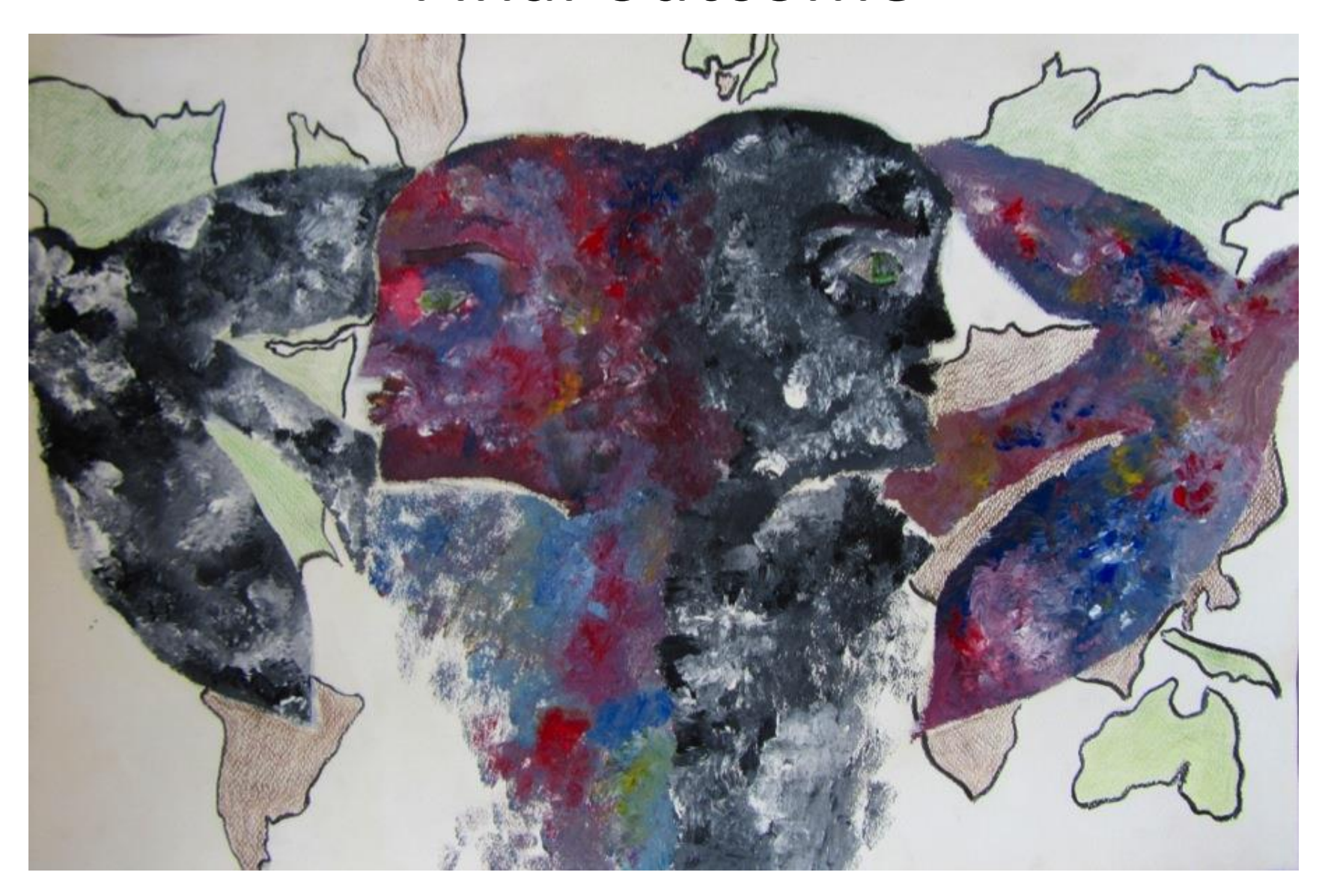
total mark 12