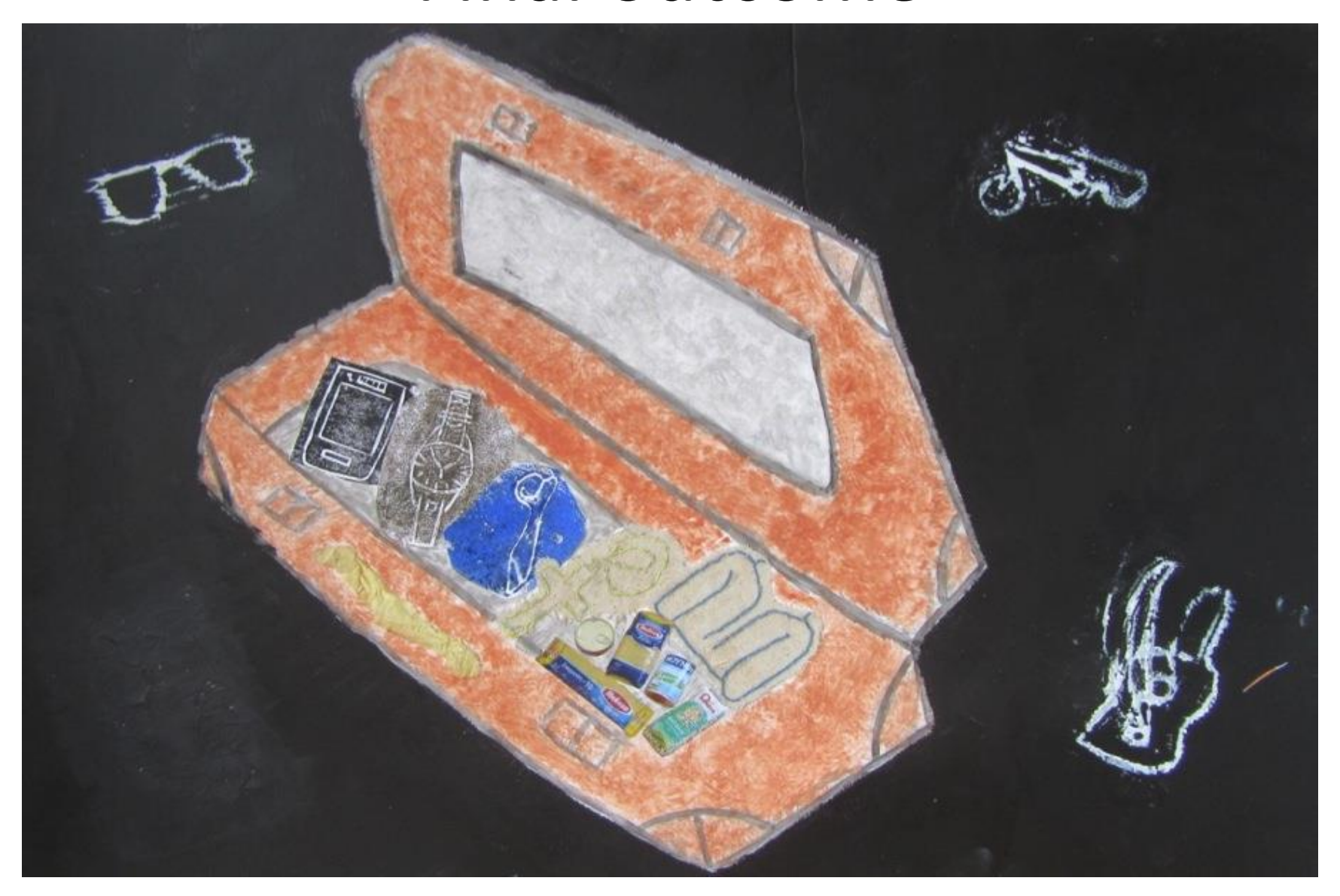
total mark 10