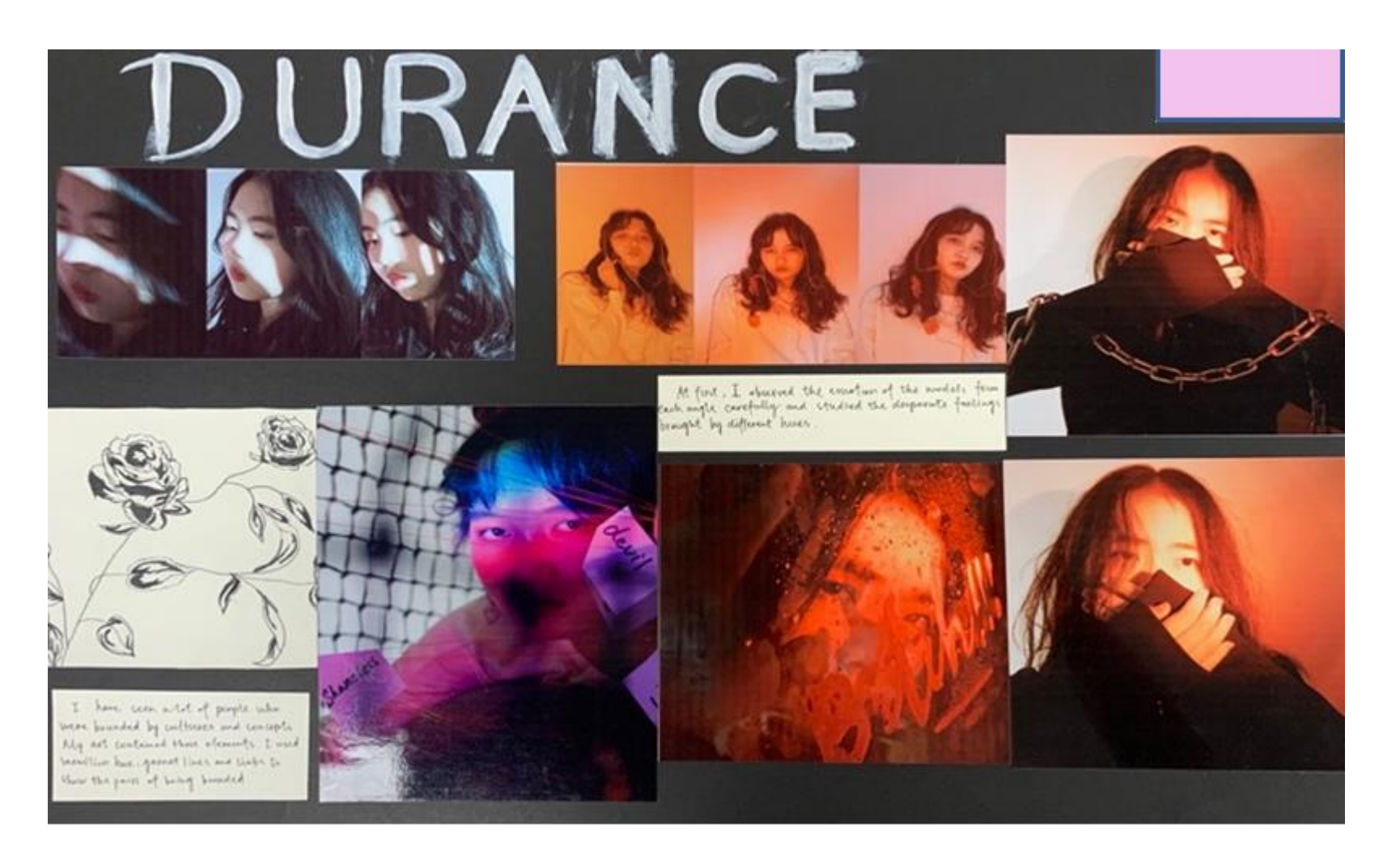
Preparatory sheet 2