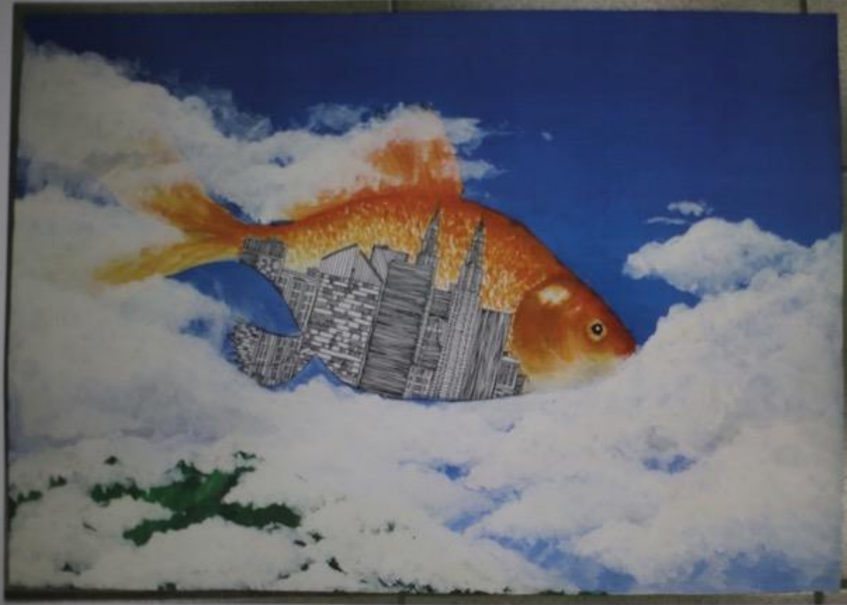
This is a photo of my final piece that was too large for the board

2020: Produce an illustration for an article in 'NATURE MAGAZINE'. The article is about clean living in the city.