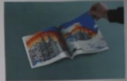
These are photos of 'work-ups' of what my piece will look like according to the brief

2020: Produce an illustration for an article in 'NATURE MAGAZINE'. The article is about clean living in the city.