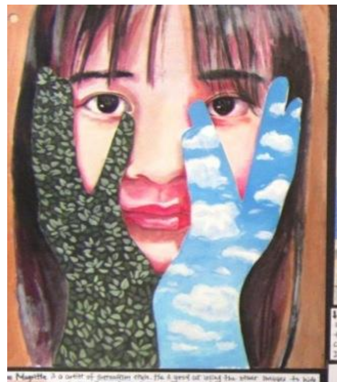
Magniffe 3 o could of Servastive their. He is good at using the wheer measure to have parts of harmon braides. I can found of his latery this and leaves to I parts the pechanism to diligious the measure to diligious the measure when hade people's forc. After I are paper to create a diagram and post braid-passed with his rate to present diagram parts and their head could be a braid-passed with his create.