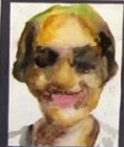
This is a self-portrait related on water-colored paper to create a blurry effect. The features of the face are not very visible, bringing out the hidden form.