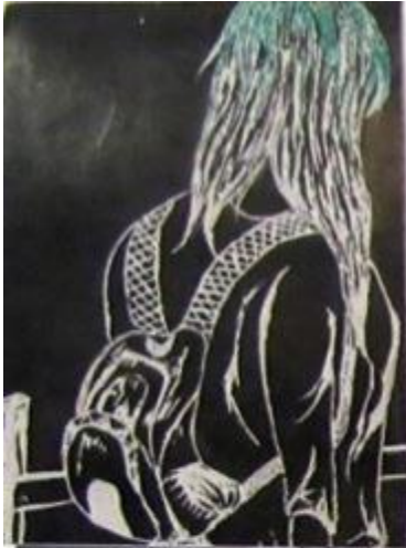
Graphical paper are successful in bringing out a girl being away from view. Upon creating the paper, white outlines were left. Green yellow pen being attention to the girl's hair and her hair also sets in or object with objects in it.