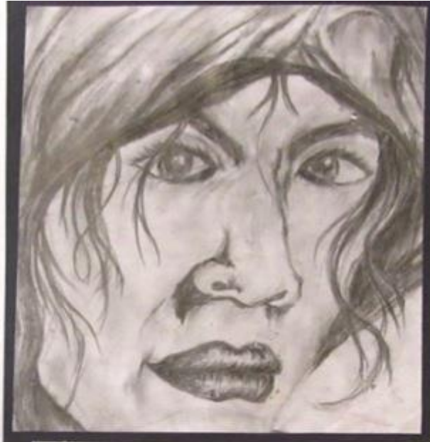
This pencil shaded image shows a woman whose hair is partly hidden with a cap. A few strands of hair are falling down her face. Different pencil shades have been used to bring out the layers in her face.