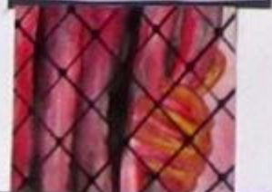
A hand painting a red marble face behind a window has been painted on water-color paper. The rest of the picture is hidden.