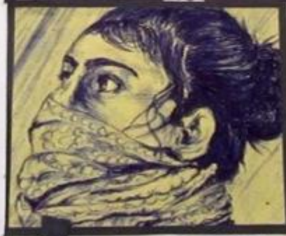
A self-portrait with the eyes and mouth covered by a wall has been shaded entirely in blue pen on yellow marble paper. Circles, wavy and strong designs have been used in the wall.