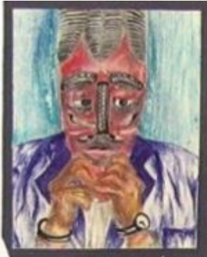
A character's face is hidden under an African mask. Pastel paper has helped in conveying the color pencil shades as well as the pen shades. Mask can be used to highlight the wall.