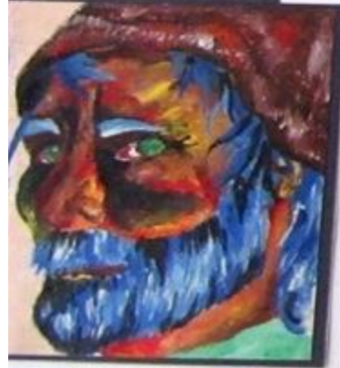
The idea of texture helps to hide off all over a serial identity under the light, used colors used. The hair also hides part of his hair. Purple white have been used up water-color paper to try out the abstract colors.