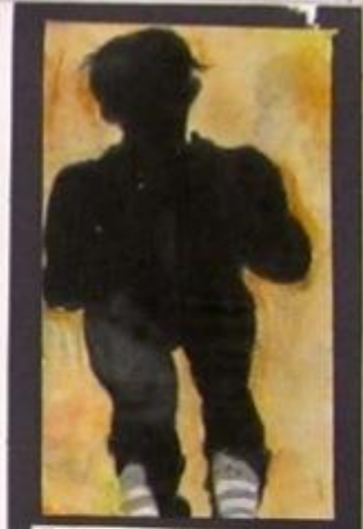
This is a shadow of a person created when standing under the sun. Only the person's socks are shown. The rest of the body is hidden. Colors pencil, pastels and soft pencil is used.