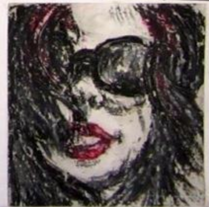
The girl's eyes are covered with shades and also her face is partially covered by her blowing hair. 3 distinct colors in pastel have been used on embossed paper: red, black and grey.