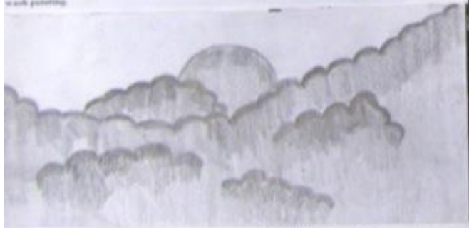
This is an observation of a sunset. It presents the theme of hidden because the sun is partially hidden behind the clouds. The media used is shading pencils.