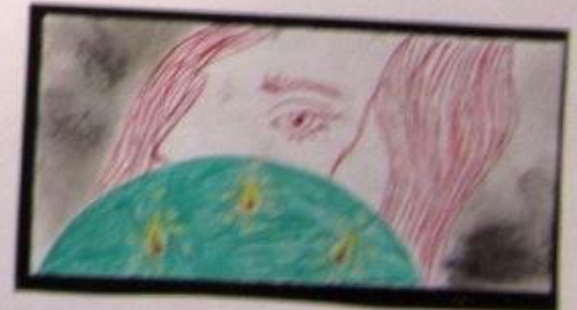
This is a combination. The face continued with the vibrant natural drawings to form an abstract and detailed mixed face. It presents nature because the face takes the hairline of the individual individual and the hairline part. The media used is colour gouache.