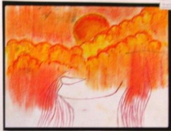
This is a combination of the sunset and the long-haired woman whereas it presents the beauty of nature over the sunset merges with the long-haired woman's face creating the beauty of a part of her face and hair and it partially takes the rest of her face. The media used is gouache and soft hair pen.