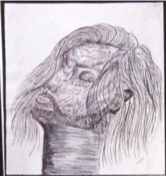
This is an observation of a man with long hair. It presents the theme of hidden because the long hair is partially hiding the man's face from view. The technique used is shading and the media used is black biro pen.