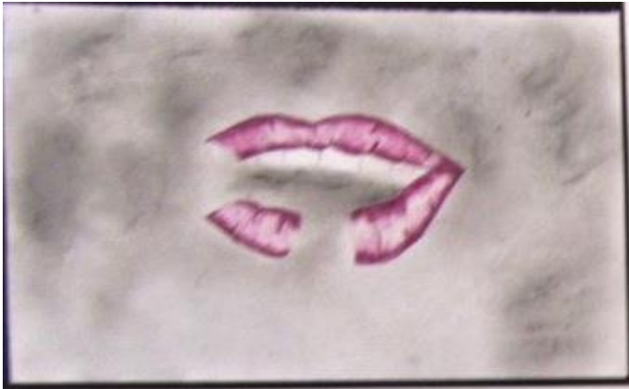
This is the development of the smiling lips and the skin effect whereas the smiling lips are used to be the source of the overblinking and blurring the facial features. The technique used is, while the media used is water colour, gouache and soft pencil.