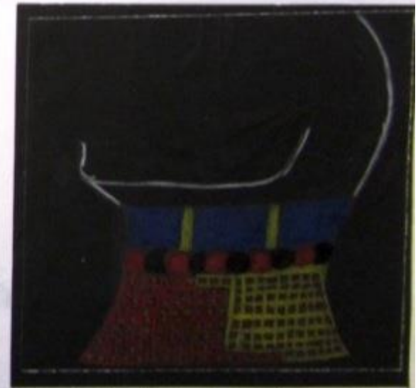
This is an observation of African necklaces. It presents the theme of hidden because even if we are able to see the silhouette of the neck we are still unable to see the natural state and colour because it is hidden underneath the necklaces. The media used is water colour pencils.