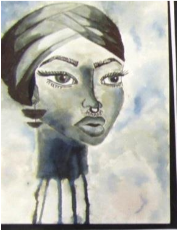
This is a painting of a woman wearing a scarf on her head. It presents the theme of hidden because the woman's hair or face is hidden underneath the scarf commonly worn due cultural or religious backgrounds. The media used is black ink and the technique used is ink wash painting.