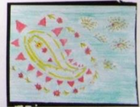
This is an oil painting by Polish Artist Karol Bak titled Between Dawn & Dusk. My transcription of the painting. I have applied the artist's inspiration techniques of using the Anarecho cycle and the sailing ship cycle and incorporating them into the traditional West African 'Gala' that covers/hides the head or hair underneath presenting the theme of hidden. The media used is black fine pen, colour pencils and pastels.