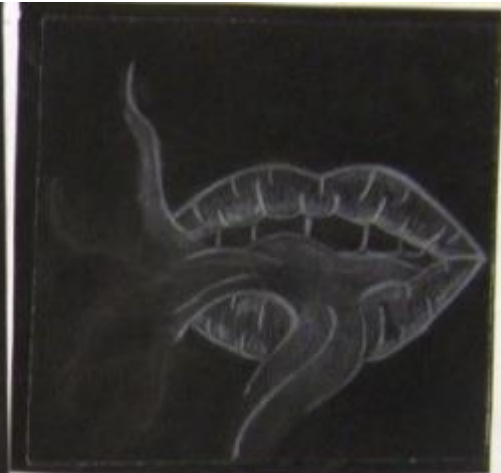
This is an observation of smoking lips. It presents the theme of hidden because as the mouth exhales smoke the contents inside the mouth (tongue, teeth & gums) are hidden behind the cloud of smoke being exhaled. The media used is white watercolour and colour pencil.