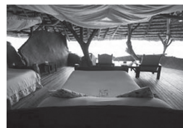
Open air room made with local materials.

The ranch also has an award winning eco-lodge built of local materials. It is owned and managed by the local Maasai community.