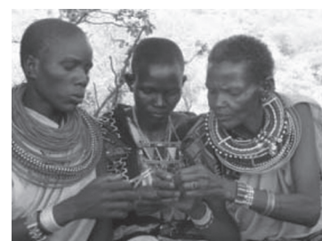
Local women making jewellery.