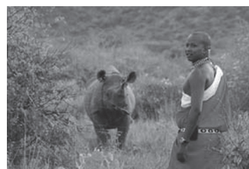
Maasai guide and rhino.

The conservation area includes a rhino sanctuary, the only one of its kind in the world. Rhinos are close to extinction and there are plans to expand the sanctuary. It requires 16 full-time rangers to monitor and protect the rhinos from poachers. Maintaining the conservation area is expensive.