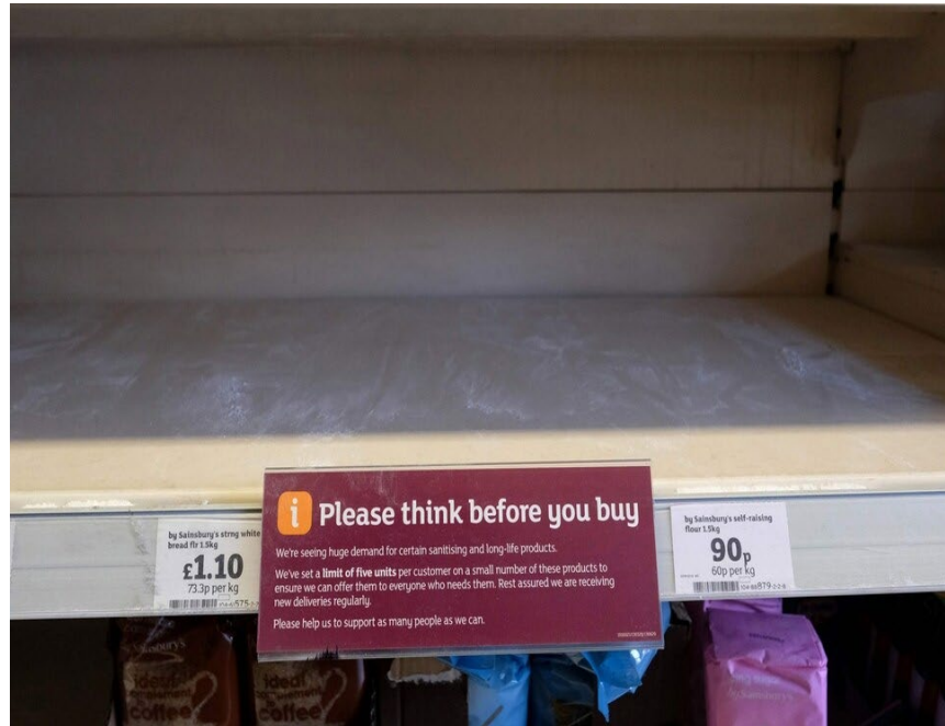
Figure 1: Empty shelves in Sainsbury's Worcester store

Sainsbury's , the UK supermarket chain, reported that its Worcester store was selling out of 1.5kg bags of plain flour within hours of a delivery arriving from suppliers. The store then had empty shelves until the next delivery arrived several days later. A spokesperson on behalf of the flour milling industry stated that 'UK flour mills are working round the clock, milling flour 24 hours a day, seven days a week to double their production to meet the demand'.