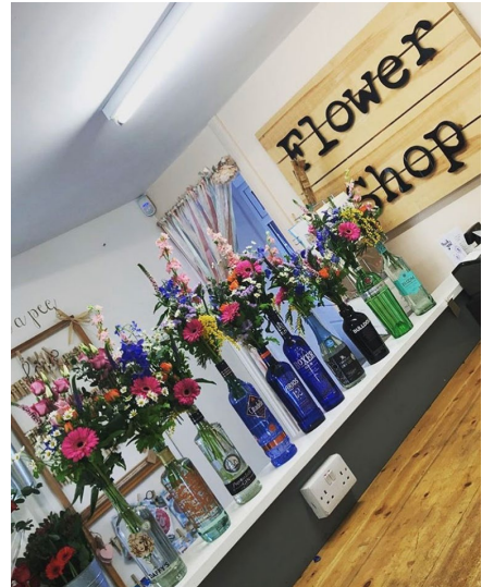
Figure 1: Displays inside JJ's Flowers