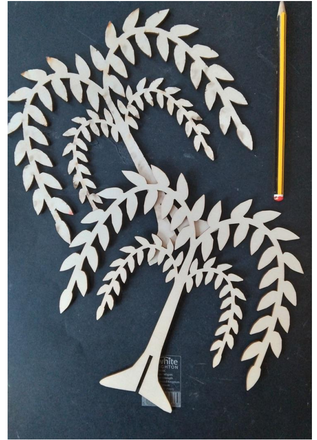
20 marks - 1TD0 C2