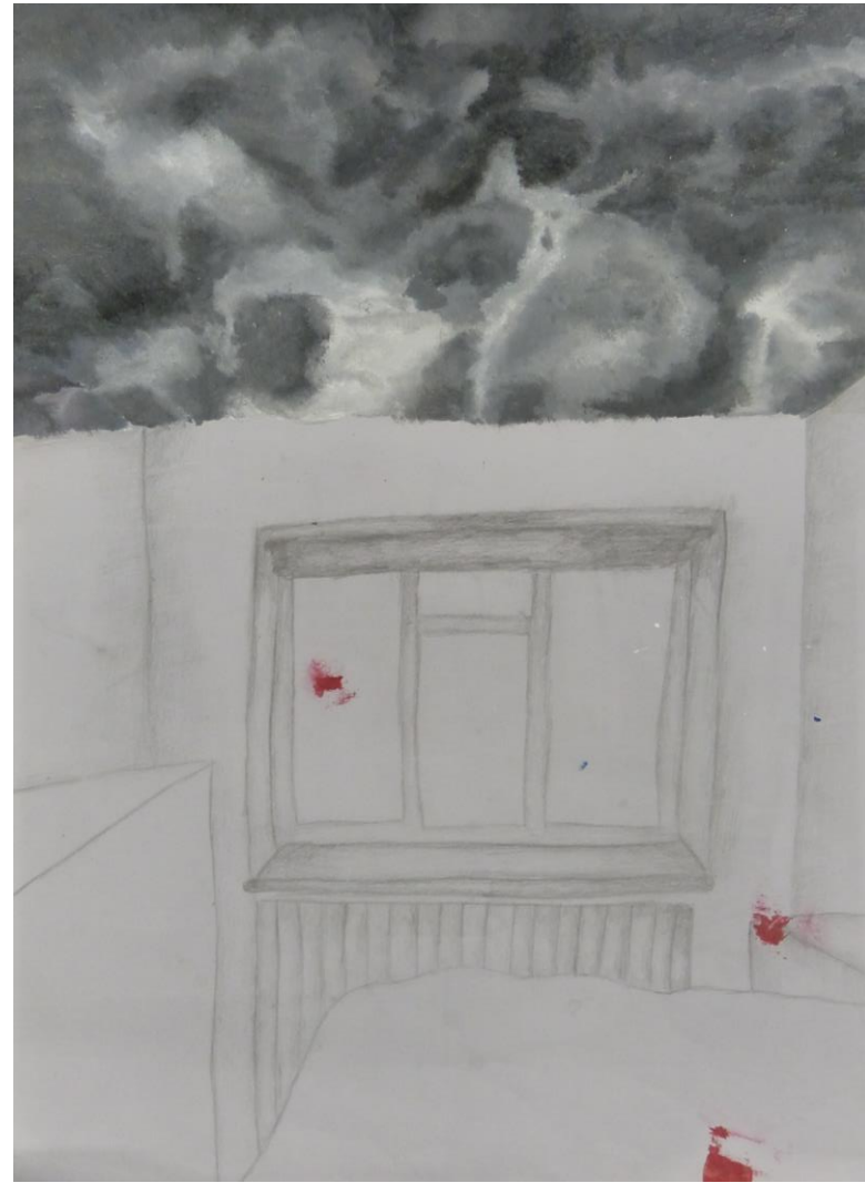
Outcome mixed media A2