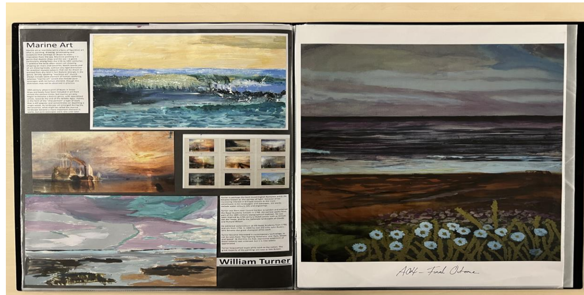
Standard Mark - 43