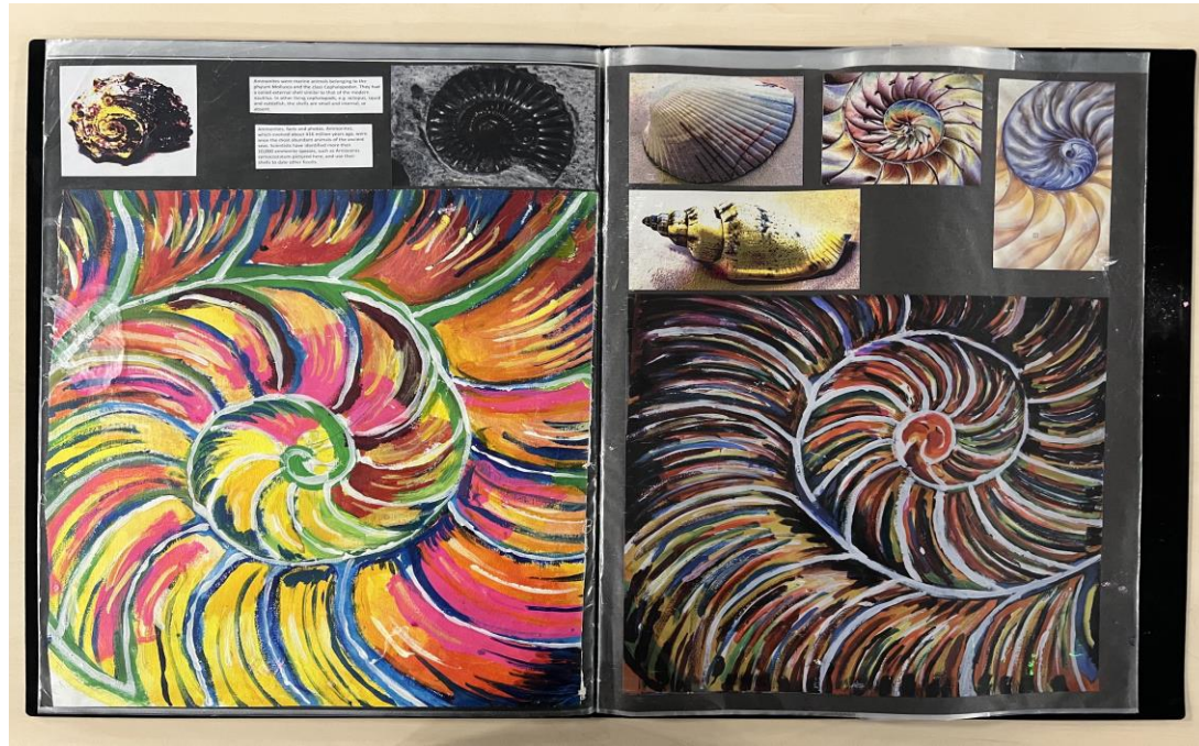
Standard Mark – 39