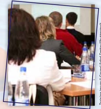
Training image

Our free Initial Assessment Tool can help you to help identify your learners' existing skill levels.