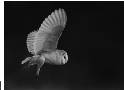
Fly one of our birds of prey