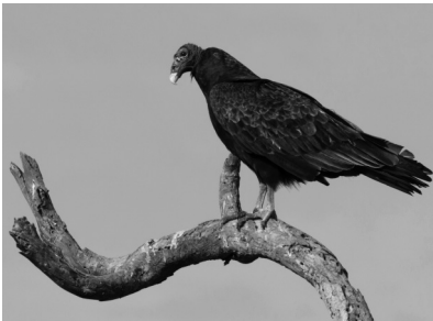
Walk through our vulture enclosure