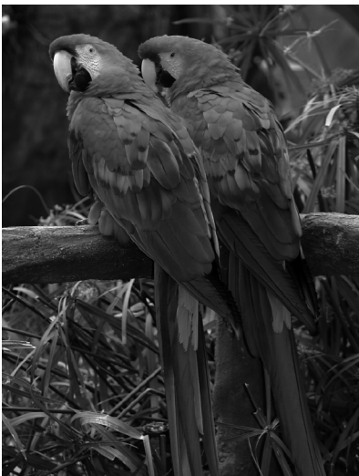
Talk to our parrots