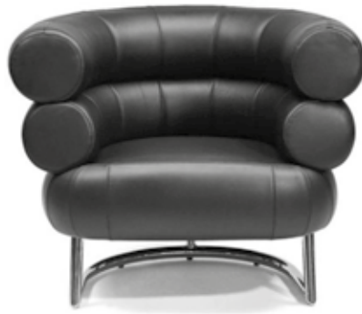
Eileen Gray's 'Bibendum' chair (Art Deco movement)

6 Figure 2 and Figure 3 show chairs by famous designers who were influential in their design movements.