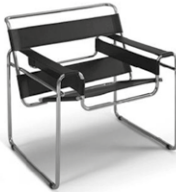
Marcel Breuer's 'Wassily' chair (Bauhaus modernist movement)