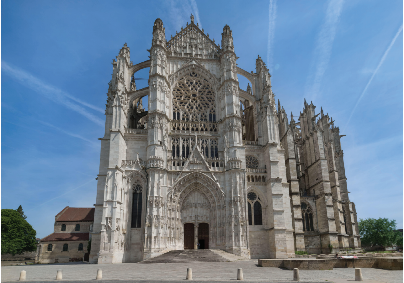
Figure 3: Beauvais Cathedral , 1225 onwards, stone and glass, (Beauvais, France)