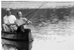
Fishing at dawn

Queen Elizabeth Forest Park and Argyll Forest Park are great places to exercise, with many excellent woodland trails for walking, running, mountain biking, cycling and horse riding.