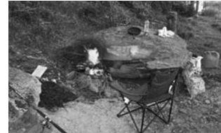
Camping on the loch shore

It is an area of contrasts from rolling lowland landscapes in the south to high mountains in the north, and has many lochs* and rivers, forests and woodlands. It is also a living, working landscape which has been influenced by people for generations. Loch Lomond and The Trossachs National Park is visited and enjoyed by many for its recreational value; there is something for everyone to enjoy.