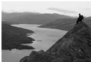
On top of a Munro

There are 20 Munros (mountains above 3,000ft/914metres) in the Park and the highest is Ben More. These offer opportunities for hill walking, mountaineering and rock climbing.