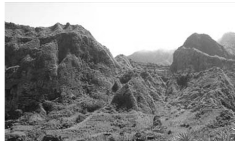
Trekking in the forested mountains on the island of Santa Antão

The Cape Verdean government are keen to develop tourism further as it is seen as a vital source of income. In 2009, 21% of the population were unemployed. Of the jobs that were available, 1 in 4 was in tourism (24,000 jobs).