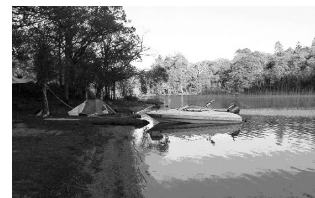
Speedboats on Loch Lomond

An exciting new water bus service began operating on Loch Lomond in summer 2010 and it was so successful the service was extended.