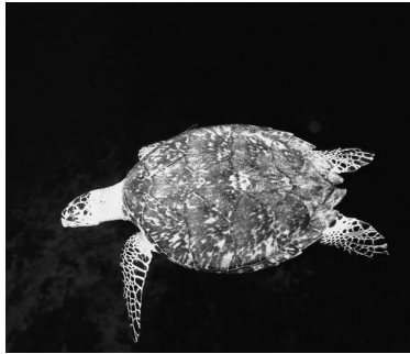
Crystal clear waters around the island of Sal, ideal for scuba diving to see the Hawksbill Turtle.

“This place is so breathtakingly beautiful, if more people knew about it the scenery and landscape would not be quite as pure and untouched as they are now” said an American tourist.