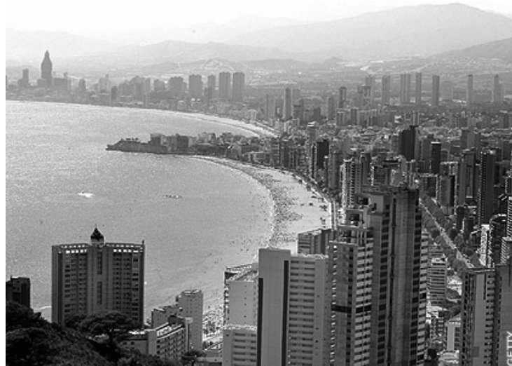
Benidorm in the 1990s

Read the following extract before answering Question 2(d).