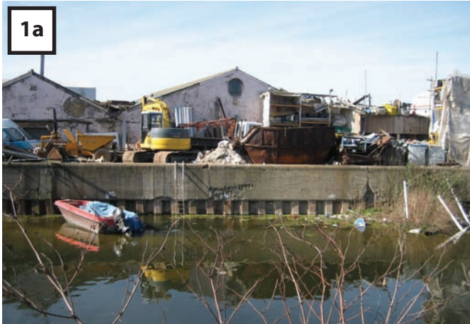
Image 1a + 1b: The site of the London Olympic Stadium in 2006–2008