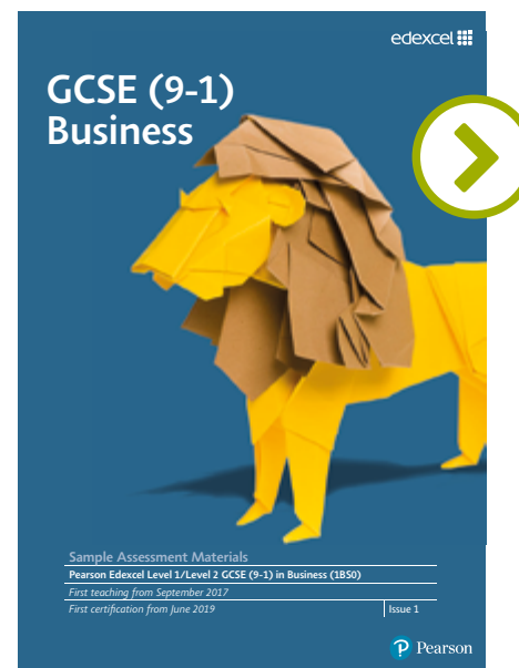
Sample Assessment Material