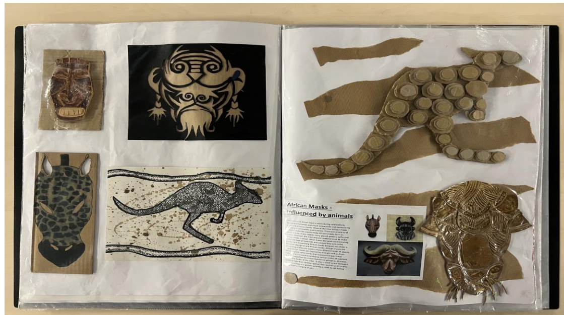
Standard Mark – 37