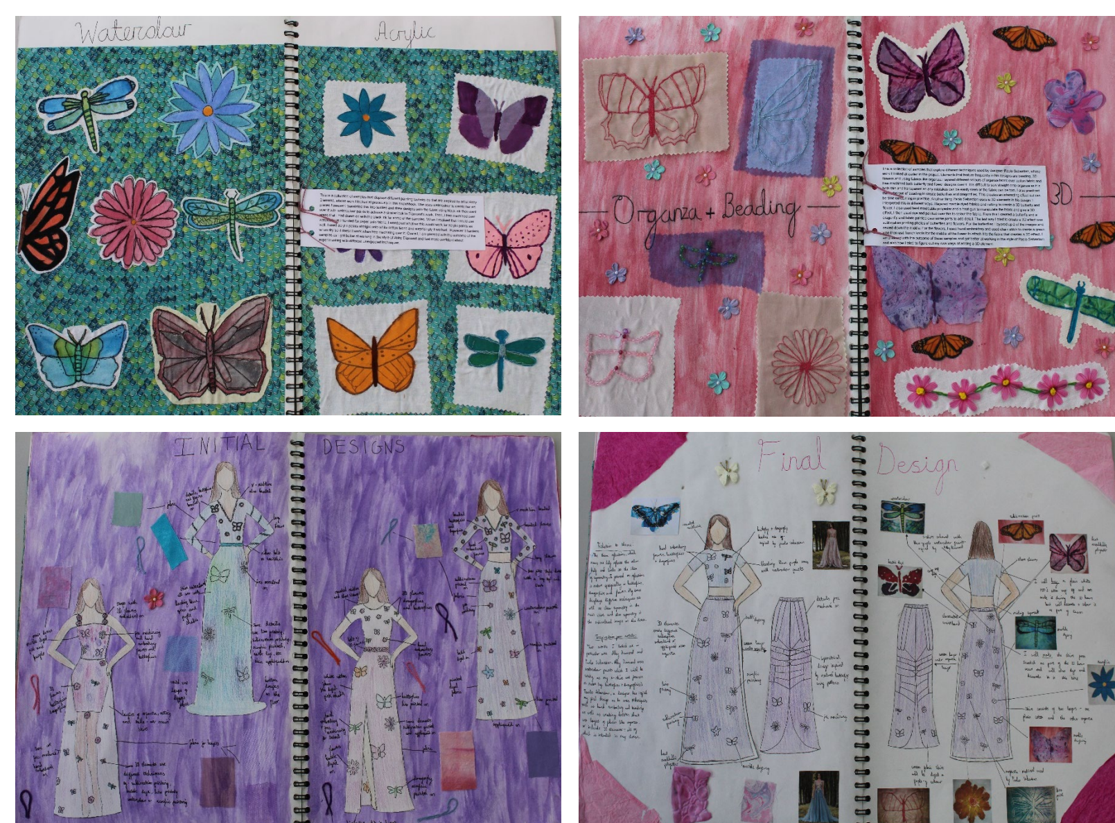
Standard Mark - 27