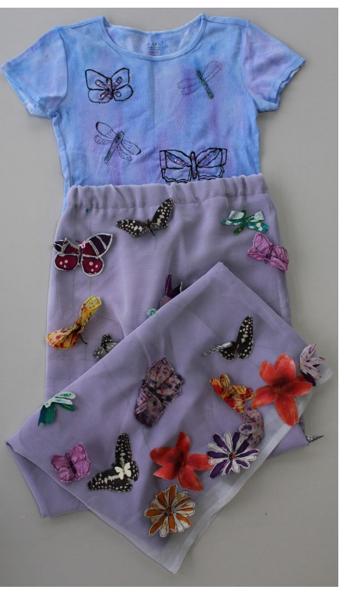
Standard Mark - 27