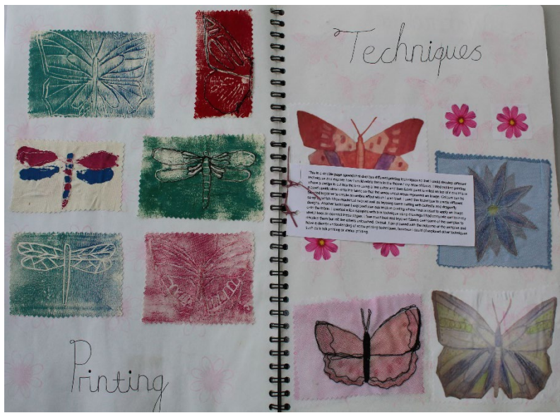
Standard Mark - 27